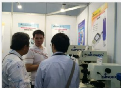
Intermach Metal Processing Machinery Fair

Sinowon is Committed to Make Measurement More Accurate and Uncomplicated!