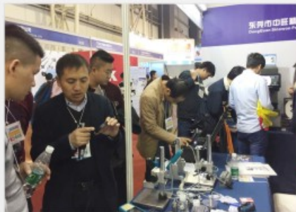
DMP Tooling and Machining Fair