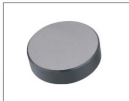
Ø60mm Flat Anvil