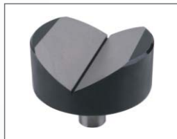
Ø40mm V-shape Anvil