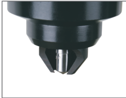
Indenter Protector Cap