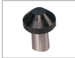
Small Flat Anvil