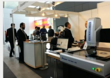
Control Stuttgart Quality Control Fair