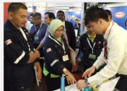
ASEAN International Machine Tool Fair