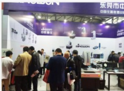
CCMT China CNC Machine Tool Fair