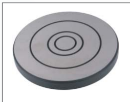
Ø150mm Flat Anvil