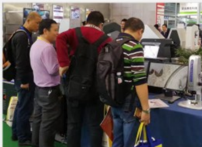
SIMM Machinery Fair