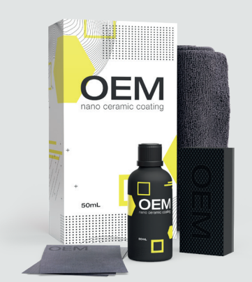
Page 4 - 5

Choose one of the ready-made product solutions that were created for you. Have your own custom box, label and bottle designs.