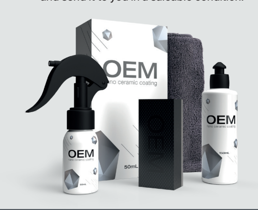
Page 6 - 13

Choose chemical, custom box, bottle and all your other components. We will produce and pack for you and send it to you in a saleable condition.