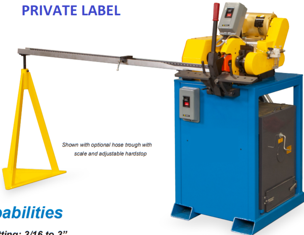
Shown with optional hose trough with scale and adjustable hardstop