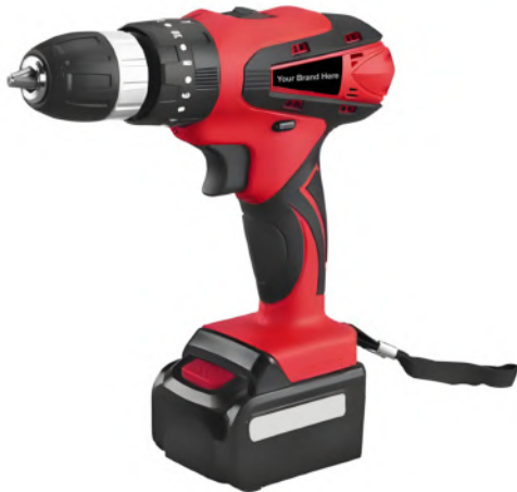
No: PTC1025 Cordless Drill 1500mAh