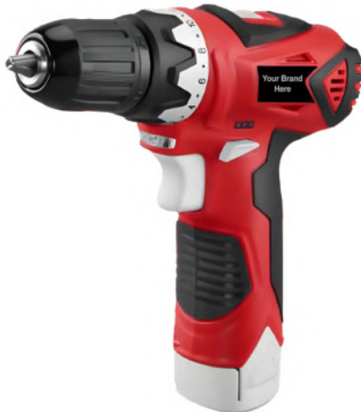
No: PTCD1001 Cordless Drill 1500mAh