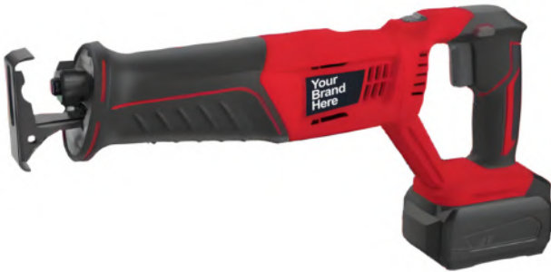
No: PTSW1001 Cordless Reciprocating Saw