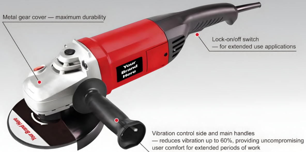
No: PTAG2001 Angle Grinder 600W