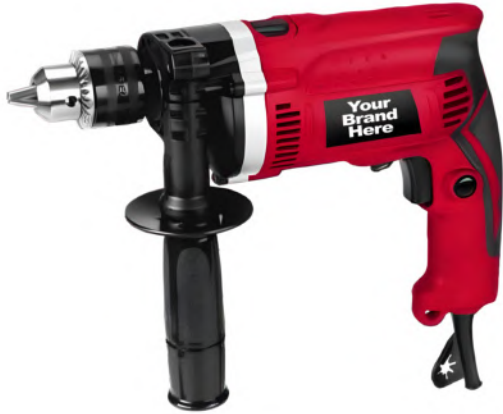
No: PTID2003 Impact Drill 650W