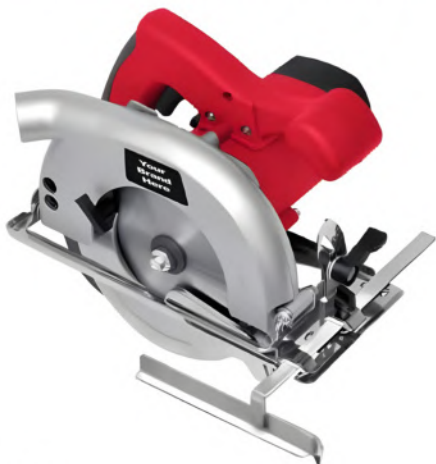
No: PTCS2001 Circular Saw 1300W