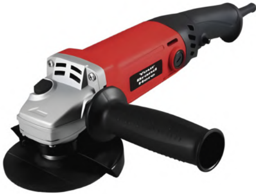
No: PTAG2007 Angle Grinder 750W