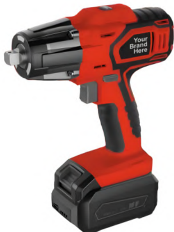
No: PTIW1004 Cordless Impact Wrench 4000mAh