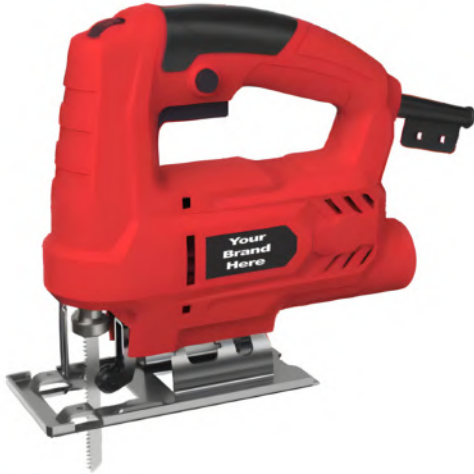
No: PTJS2009 Jig Saw 400W