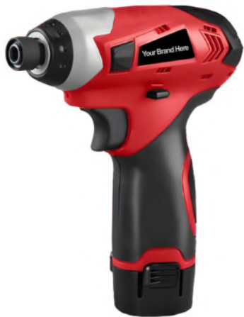
No: PTCS4001 Cordless Screwdriver 90N.m