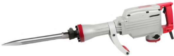
No: PTDB2001 Demolition Breaker 1300W