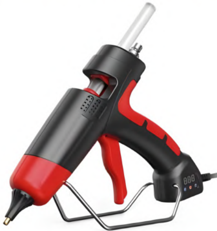
No: PTGG2001 Hot Melt Glue Gun 500W