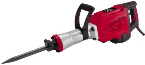
No: PTDB2005 Demolition Breaker 1600W