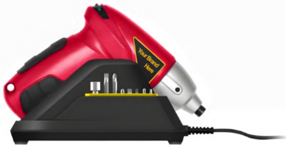
Charging base doubles as accessories holder