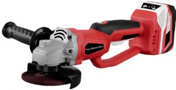
No: PTAG1001 Cordless Angle Grinder 3000mAh