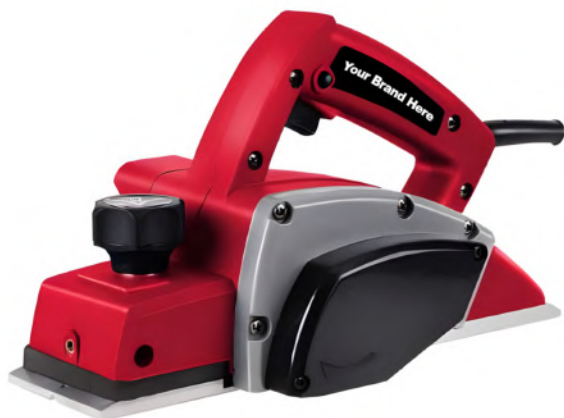
No: PTPL2001 Planer 600W