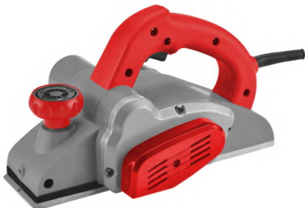
No: PTPL2009 Planer 650W