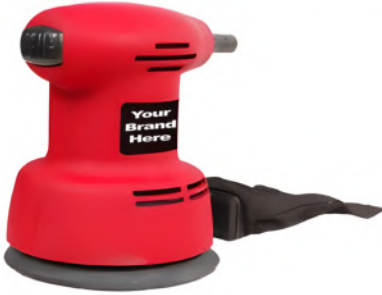
No: PTSN2001 Random Orbit Sander 180W