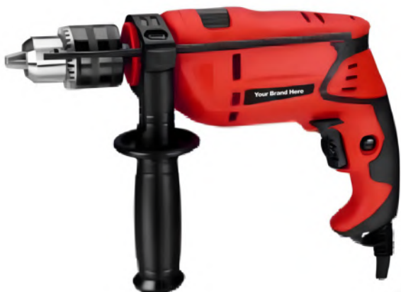
No: PTID2011 Impact Drill 600W