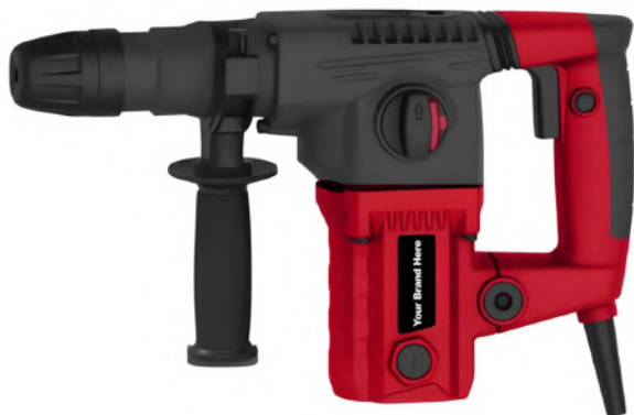
No: PTRH2007 Rotary Hammer 900W