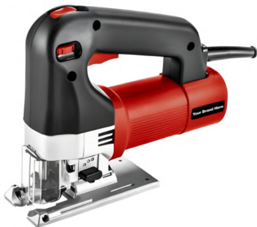
No: PTJS2005 Jig Saw 600W