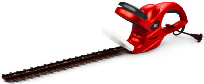
No: PTHT2002 Hedge Trimmer 500W / 600W