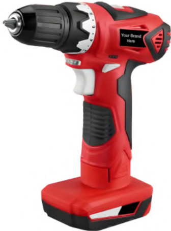
No: PTC1005 Cordless Drill 1500mAh