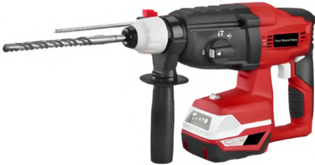
No: PTRH1001 Cordless Rotary Hammer 3000mAh