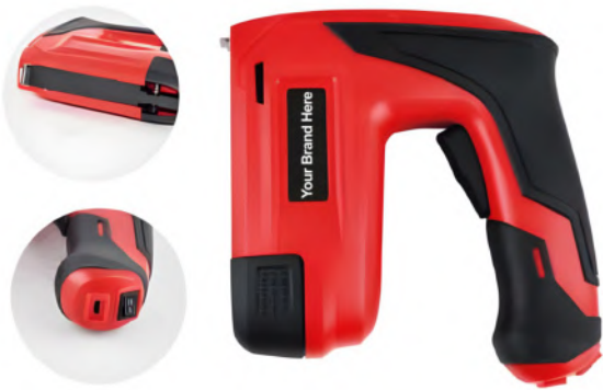
No: PTCN1005 Cordless Nailer 1500mAh