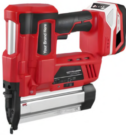
No: PTCN1001 Cordless Nailer 2000mAh