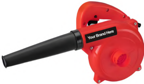
No: PTBL2001 Blower 350W