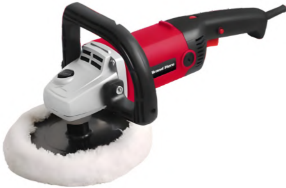
No: PTPO2001 Polisher 1200W