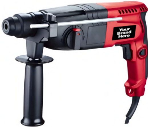
No: PTRH2003 Light Rotary Hammer 620W