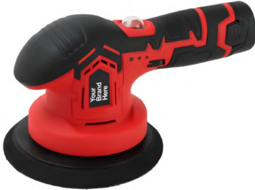
No: PTOT1007 Cordless Polisher 2000mAh