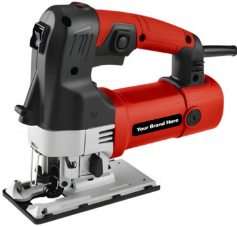
No: PTJS2001 Jig Saw 600W