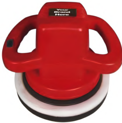
No: PTPO2005 Polisher 110W