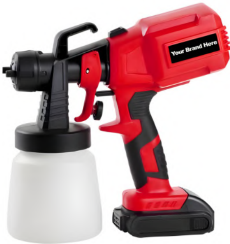
No: PTSP1003 Cordless Electric Spray Gun 18V