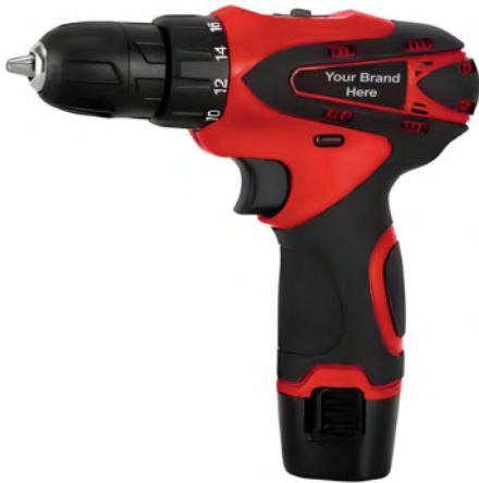
No: PTC1013 Cordless Drill 1300mAh