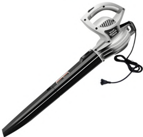
No: PTBL2010 Blower 2000W