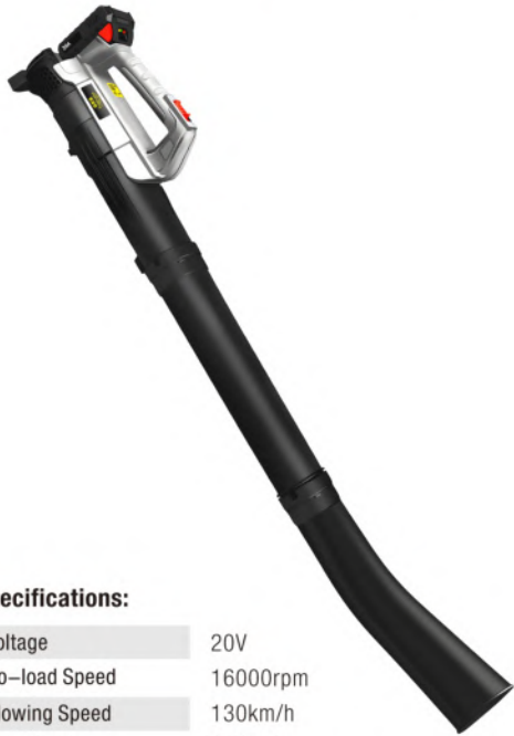
No: PTCB1004 Blower 20V