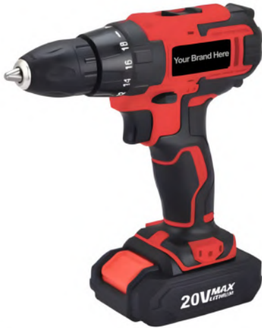
No: PTC1021 Cordless Drill 1500mAh