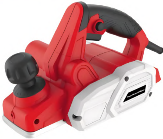
No: PTPL2005 Planer 650W