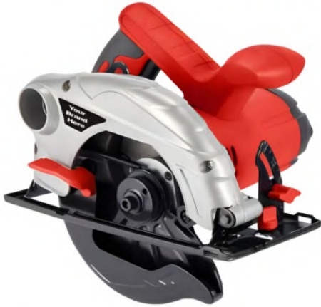
No: PTCS2009 Circular Saw 1050W