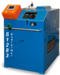
S1283 Endformer (Selectable up to 3- Hits) (Hydraulic or Servo)