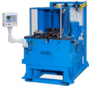
S1183 Series Endformer (Selectable up to 6 Hits)