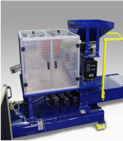
Bowl Feeders for Couplings, Sockets, Ferrules, Nuts, Blocks