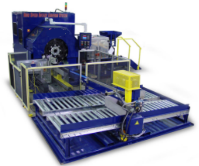
S1138 6-Hit High Speed Rotary Endformer