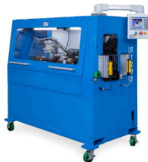
S1203 Servo Roll Groover