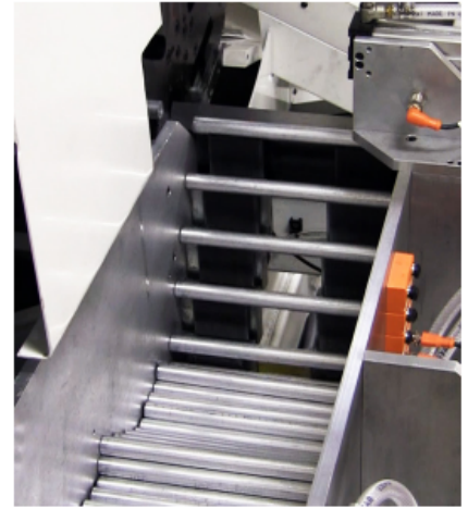
Automated Tube Hopper