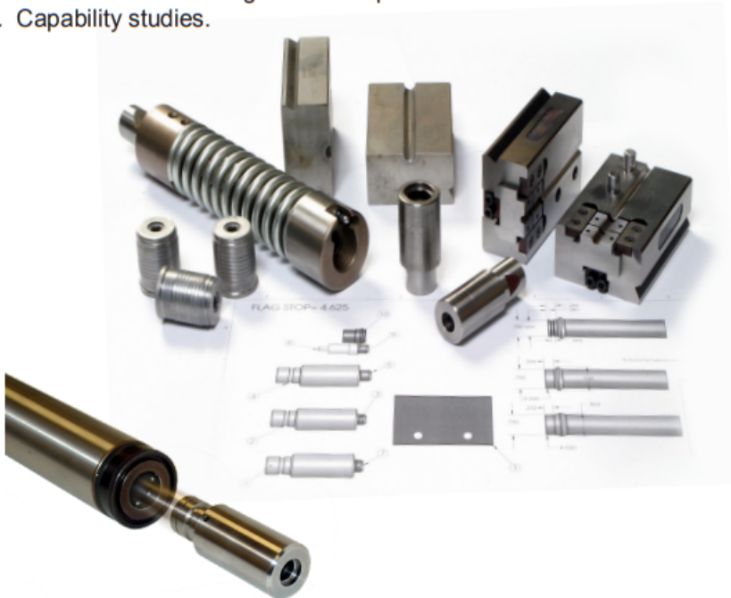
Quick Change Punch Holders