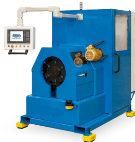
S1209 Servo Endforming System (Up to 4-Hits, including Optional Servo Roll Grooving station)

Tube diameters from 1/8" to 3.00", up to 6 Hits