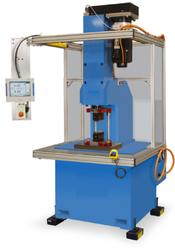
S1210 Servo Die Set Crimper