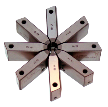
Crimp Jaws 4, 6 or 8 Jaw Profile