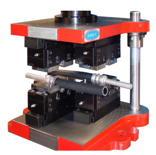
S1087 Double Crimp Die-Set