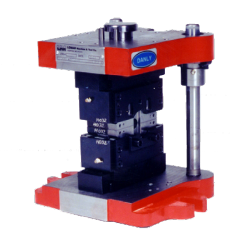
S1087 Single Crimp Die-Set