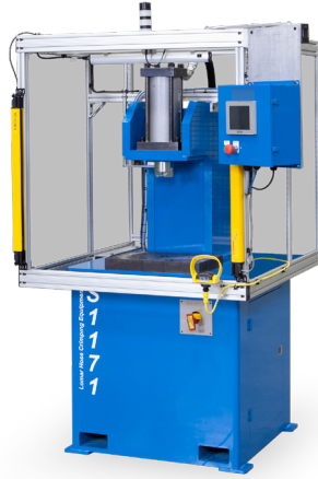
S1171 Air/Oil Die Set Crimper