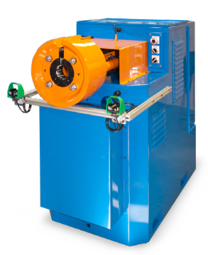
S1172 Radial Crimper