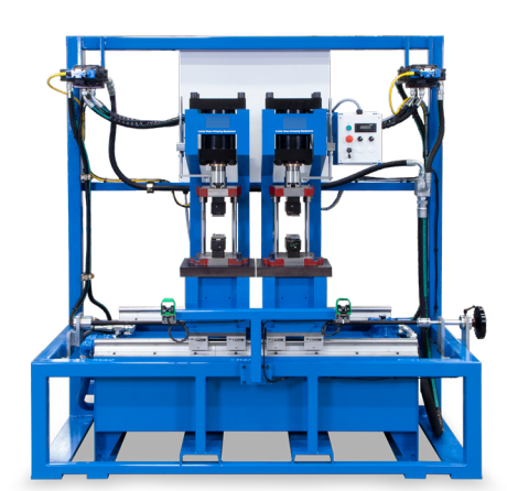
S1137 Dual Head Die Set Crimper