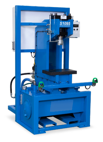
S1095 Die Set Crimper