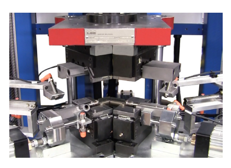
Double Insertion & Crimp Die-Set

Crimp development team can assist you with the design and development of tooling for all of your crimping requirements.