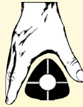
Non-Slip Triangular Handle