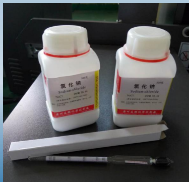
Sodium chloride (testing salt)