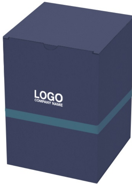
Color with Logo