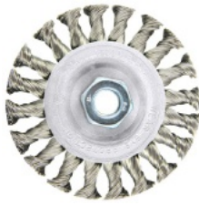
Wire Wheels & Brushes