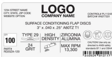
Box Label 1