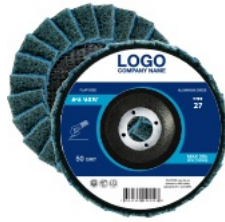
Surface Conditioning Discs