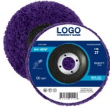
Clean & Strip-It Discs