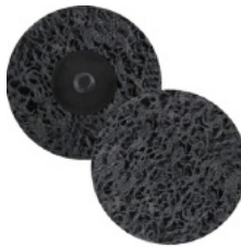
Quick Change Clean & Strip-It Discs