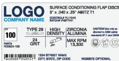
Box Label 4 (Company Colors)