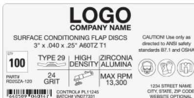
Box Label 3