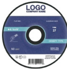
Cut Off Wheels