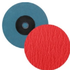
Quick Change Sanding Discs