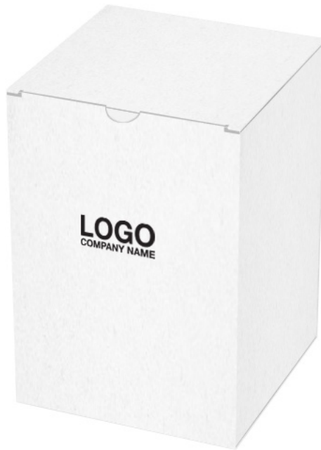
White with Logo