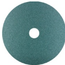
Resin Fiber Discs