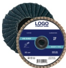
Quick Change Flap Discs