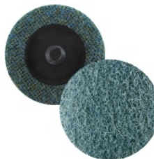
Quick Change Surface Conditioning Discs