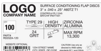
Box Label 2