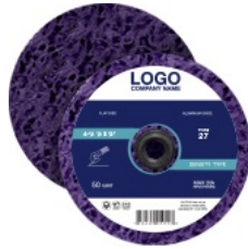
Quick Change Clean & Strip-It Discs