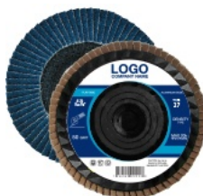
Trimnable Flap Discs