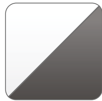
Half & half